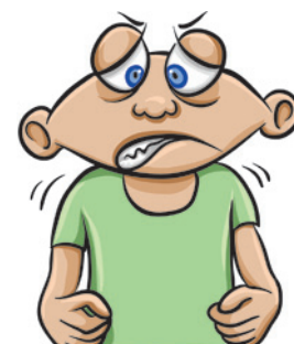
Nervous or upset

If low blood sugar is not treated, it can become severe and cause you to pass out. If low blood sugar is a problem for you, talk to your doctor or diabetes care team.