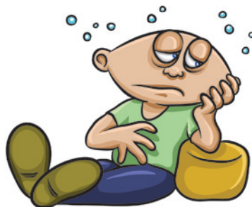
Weak or tired