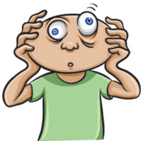
Dizzy or shaky